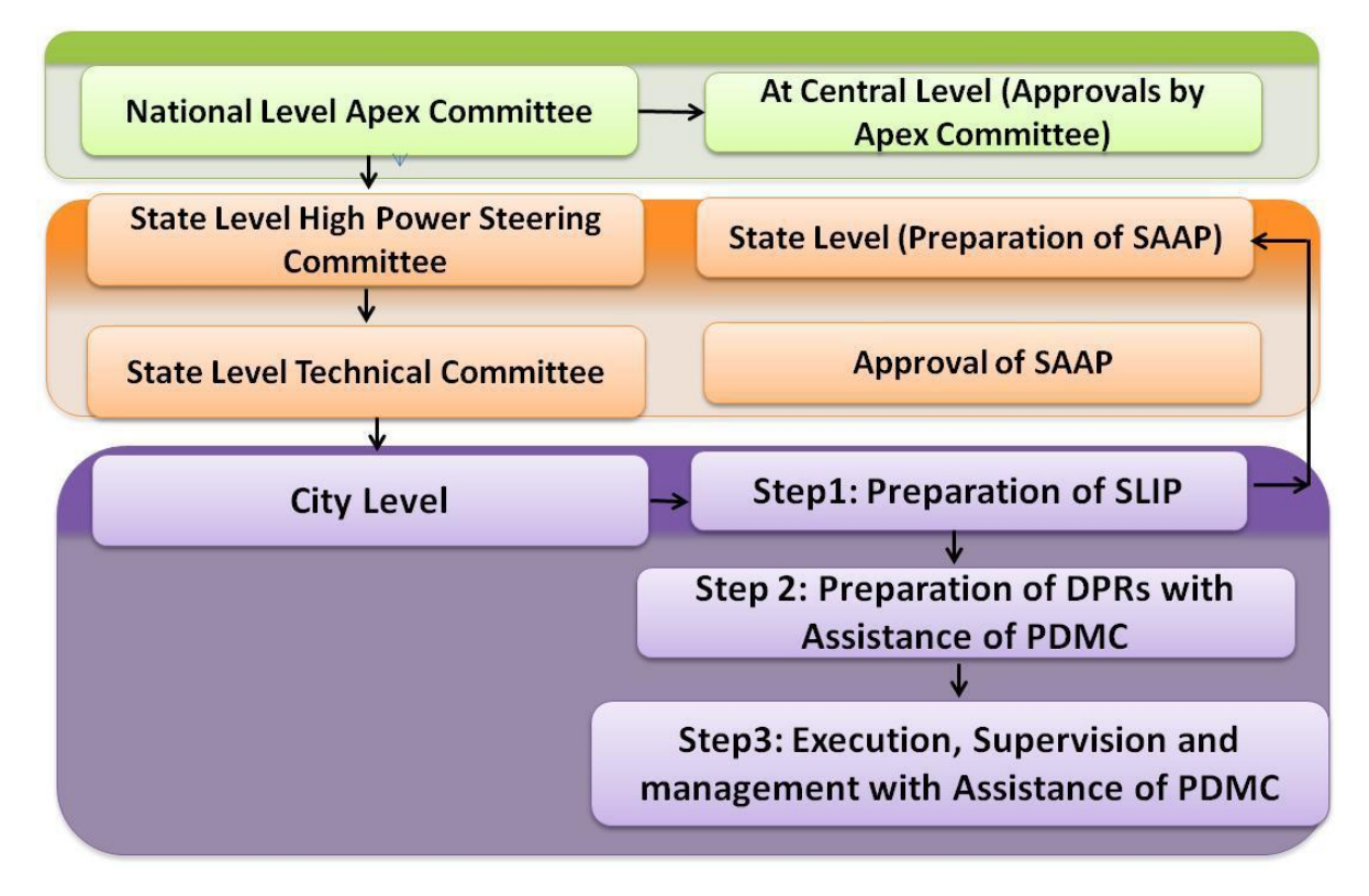
Figure 1-1: Project Management Structure

then put up to SLTC and SHPSC for approval. After detailed deliberations in SHPSC meeting the SAAP was finalized and decided to recommend for approval from the Apex Committee. The Project Management Structure for AMRUT Mission is presented in Figure 1-1.