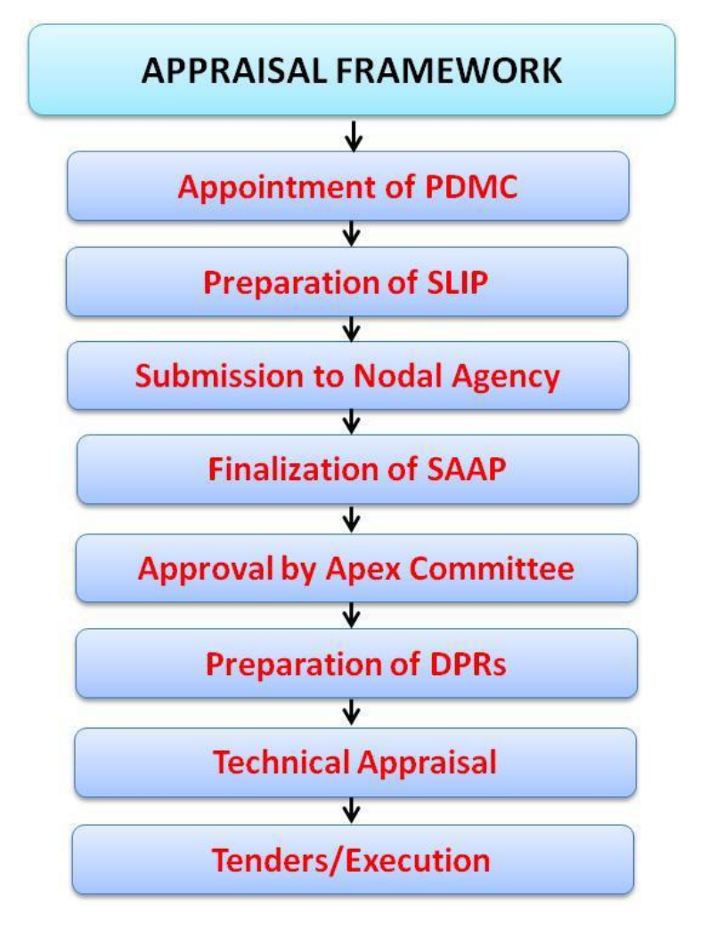
Figure 1-2: Appraisal framework for Projects under AMRUT Mission